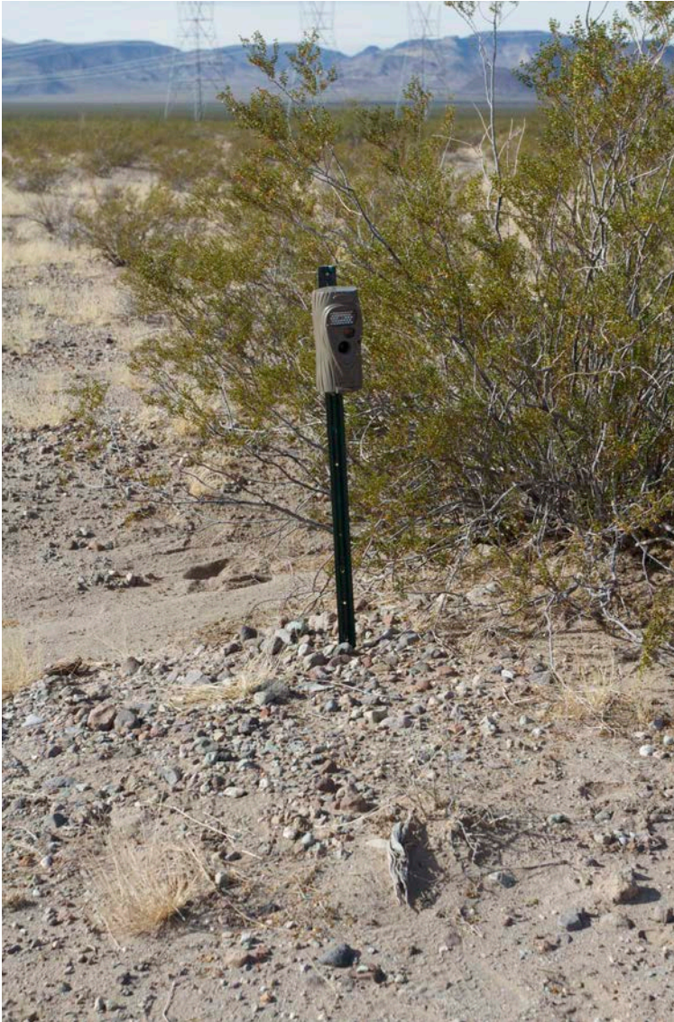
Figure 2. Photograph of the motion-triggered camera used to monitor coyote presence on the BCCE.

contained a single coyote. The one exception has of what appeared to be an adult and a young. A total of 95% (261/275) of the photos were from the camera placed near the 2° sewage runoff wetlands just south of Boulder City sewage treatment plant, the remaining came from a camera placed 0.9 mi south of the El Dorado Substation in the southwestern section of the BCCE. In addition, there were 63 photographs of Desert Cottontail Rabbits ( Sylvilagus audubonii ), 9 Greater Roadrunners ( Geococcyx californianus ), 9 of two people in one instance, 5 of 2 dogs ( Canis lupus familiaris ) on one day, and 2 of a raccoon ( Procyon lotor ).